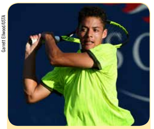
Ulises Blanch, 19, was ranked as high as No. 2 in the ITF World Junior Rankings and reached the Wimbledon junior semifinals in 2016.